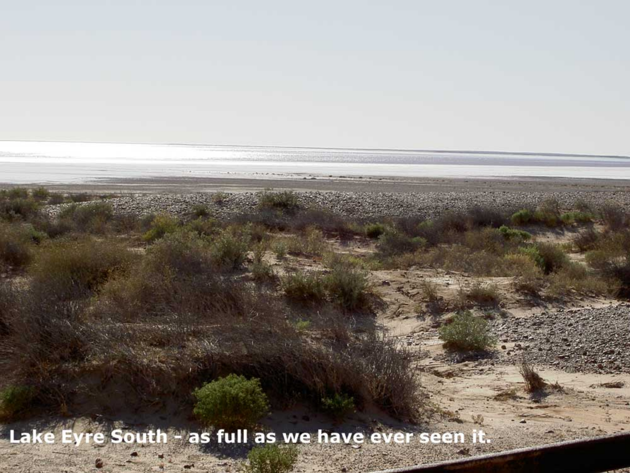
Lake Eyre South - as full as we have ever seen it.