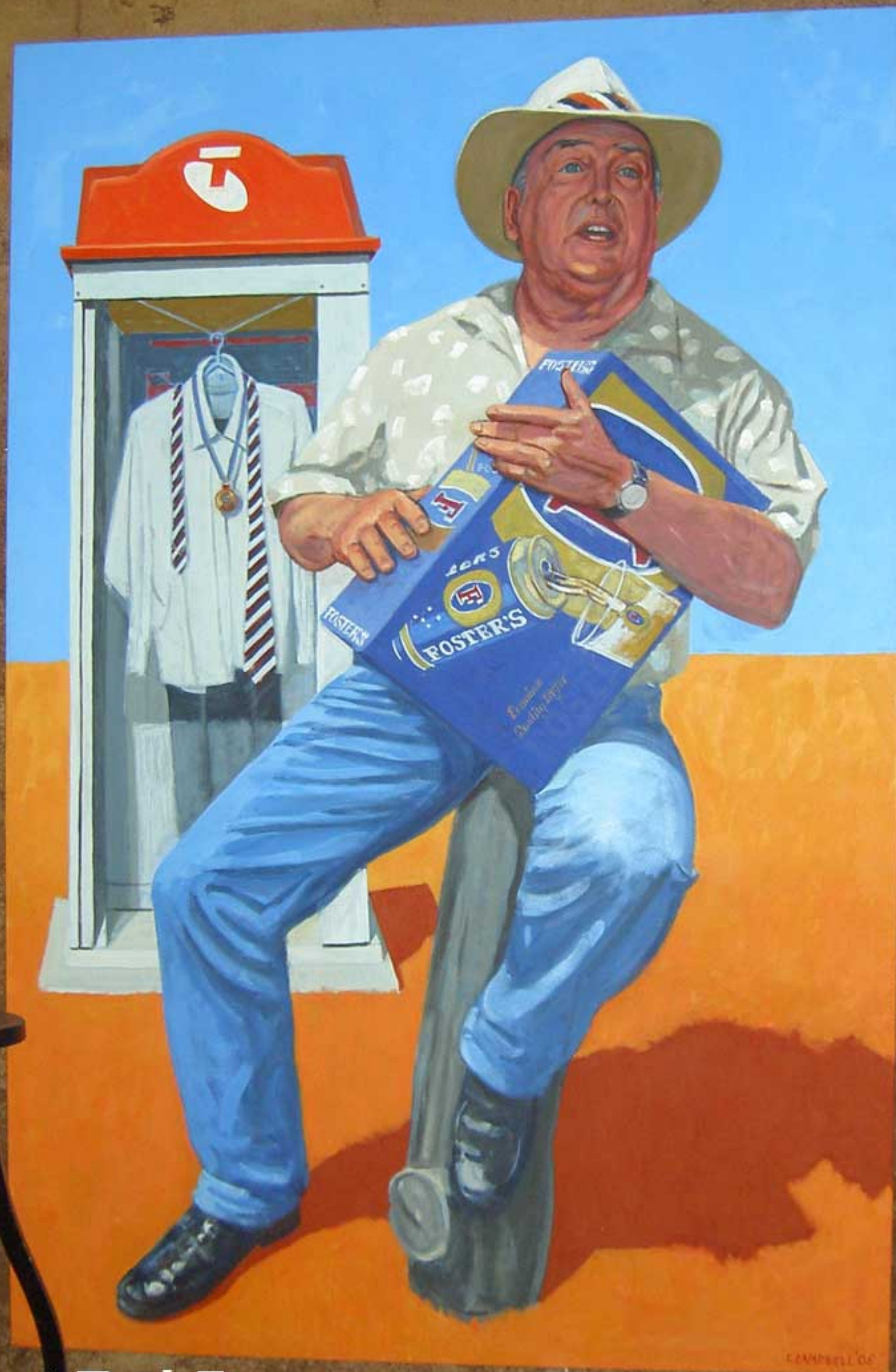
Our Host Ted Egan