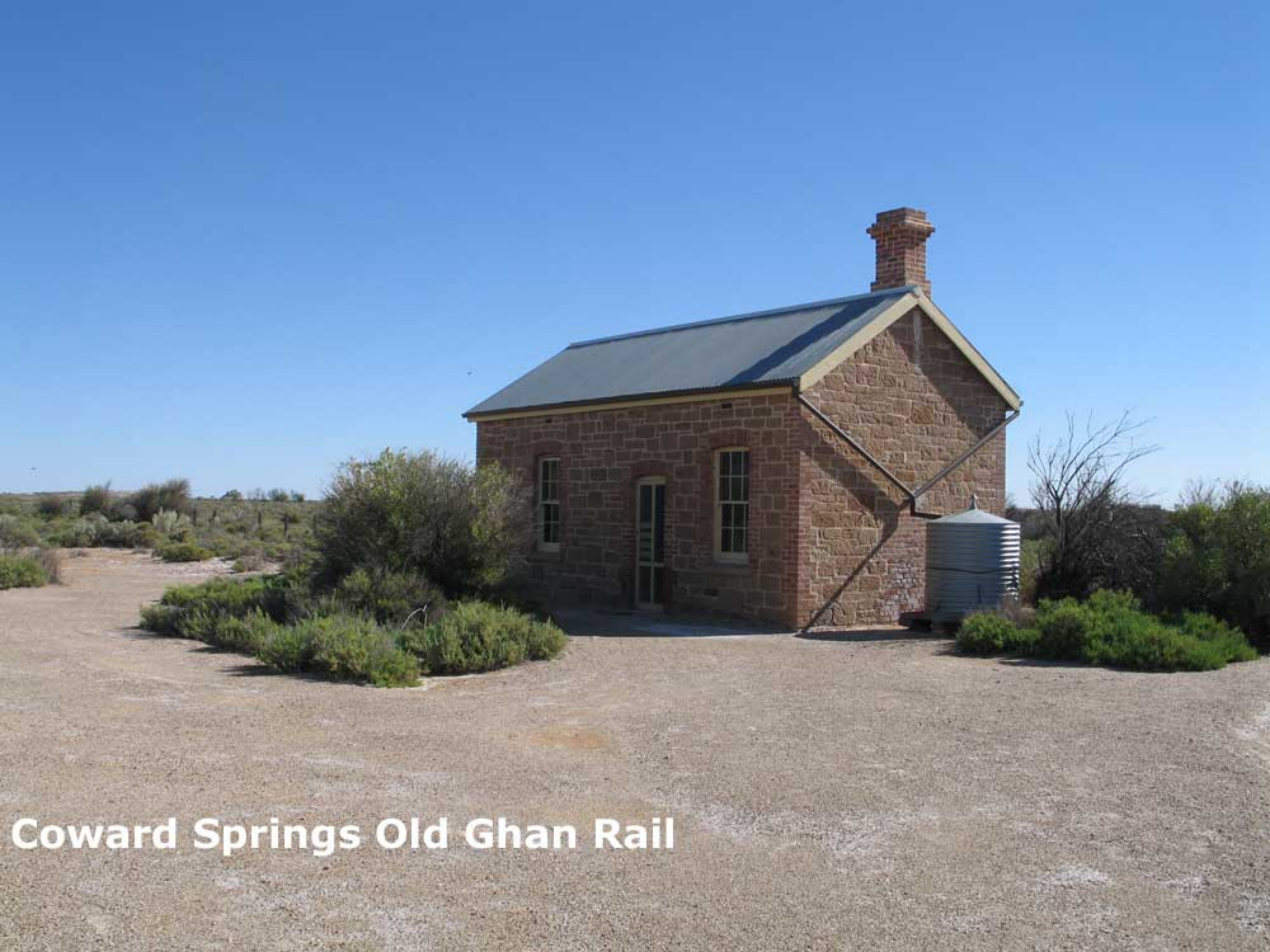
Coward Springs Old Ghan Rail