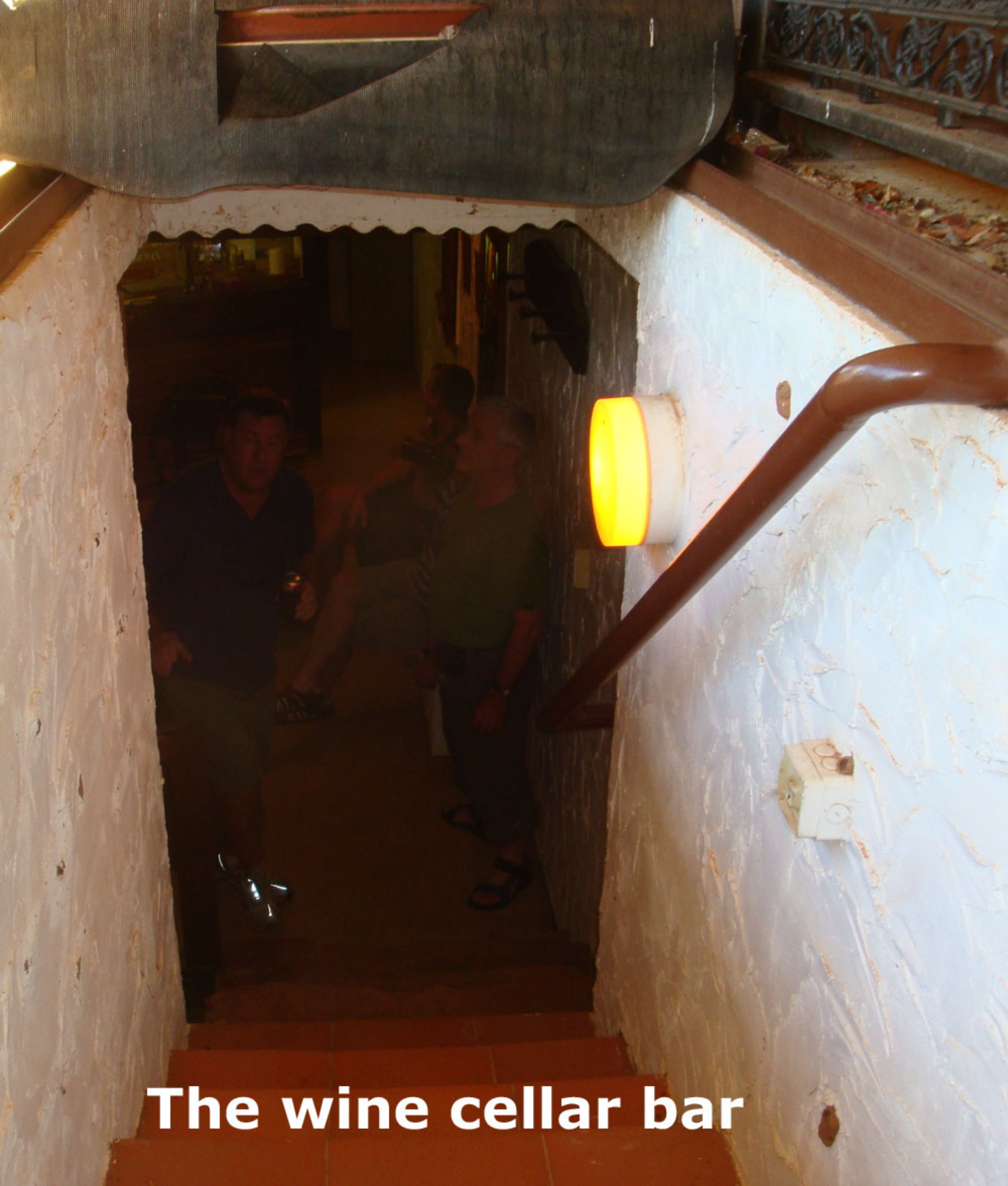
The wine cellar bar