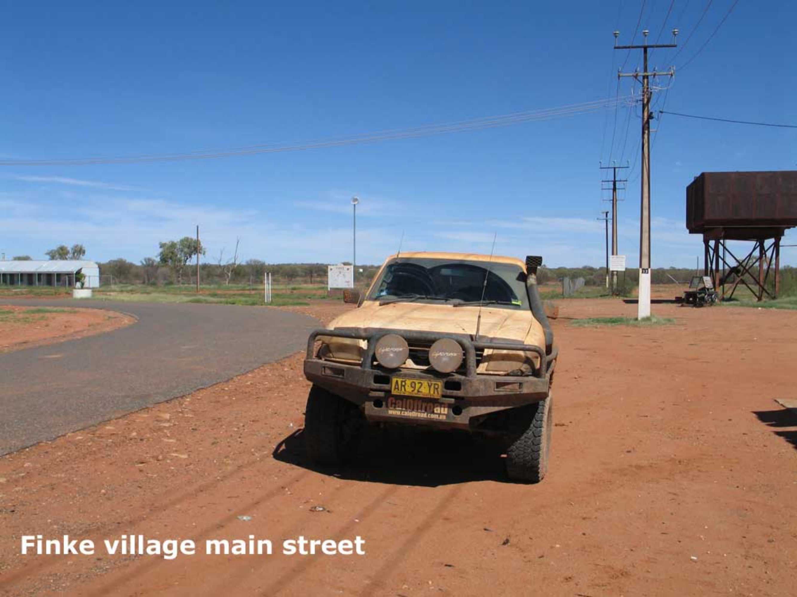
Finke village main street