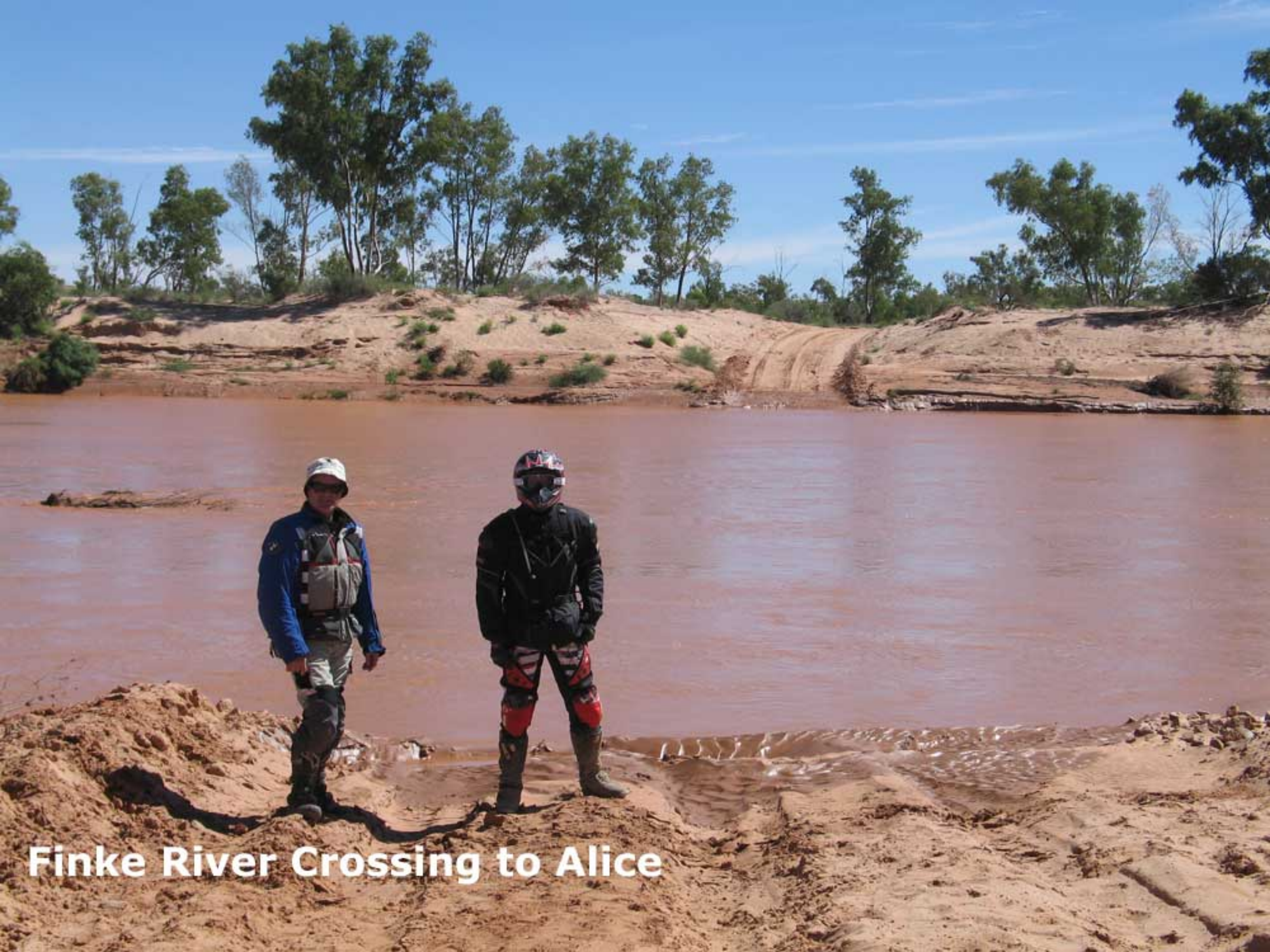
Finke River Crossing to Alice